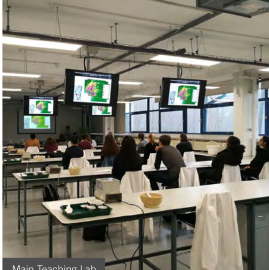
Main Teaching Lab

Find out more and take a virtual tour of the laboratories at geog.qmul.ac.uk/facilities .