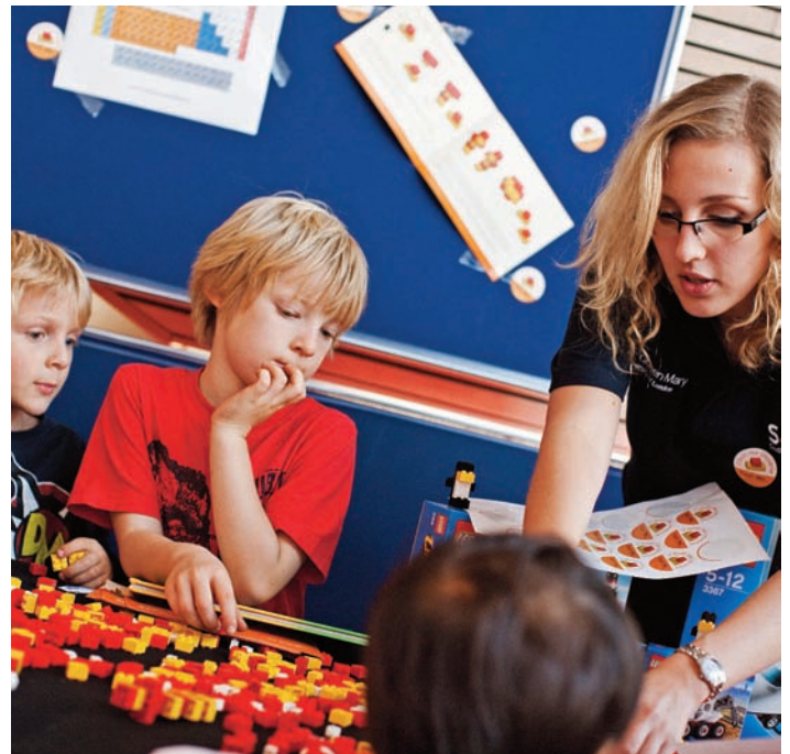
Building a Lego universe at Researchers' Night, a Europe-wide event showcasing how scientific research impacts on people's lives