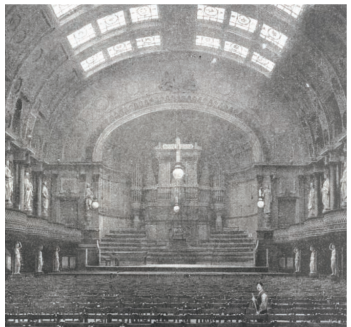
The Queen's Hall in the original People's Palace

For many years the People's Palace housed the College's canteen and the Principal's Dining Suite. In the 1990s, the building was refurbished again – the Small Hall (or Stern Hall) was demolished and replaced with the Skeel Lecture Theatre and part of the stalls of the Great Hall became teaching rooms.