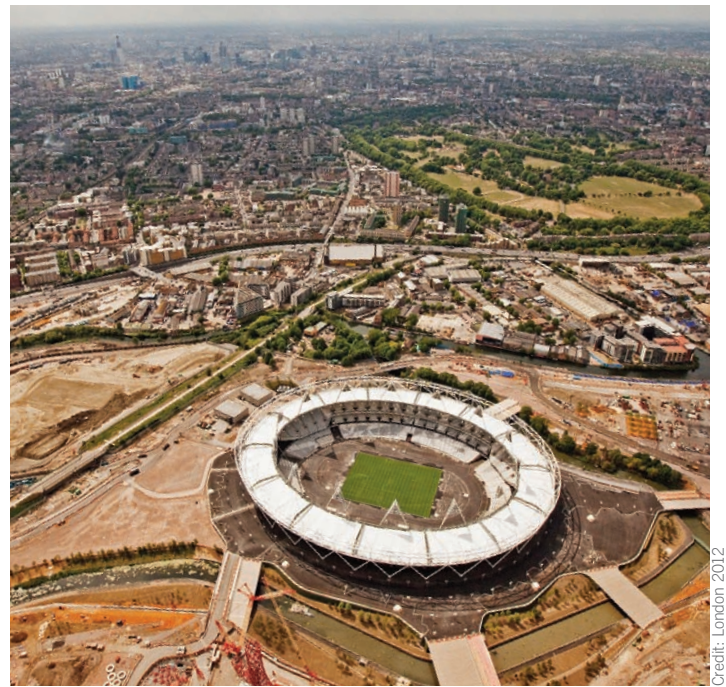
The Olympic Park under development

Undergraduate geography students have also been involved in Olympic-related research – for which they won Bronze in the ‘Research Councils UK Award for Exceptional Research Contribution’ category. The students evaluated the success of community organisations such as London Citizens in securing Olympic jobs – paid at the Living Wage of £8.30 per hour – for unemployed east Londoners.