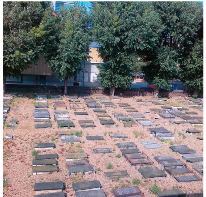
The Novo Cemetery before the re-landscaping work

It is traditional for Jewish gravestones to be plain and generally unadorned. However, some graves at the Novo depict synagogue imagery, such as books, arks and scrolls; other images include that of an arm reaching down from a cloud holding an axe and felling a tree, symbolic of a life cut short. In the Sephardic tradition the stones are placed horizontally above the grave – a statement of humility, acknowledging death as the great leveller. Small stones or pebbles are placed on top of the gravestones, rather than flowers, as a respectful mark of a visit.