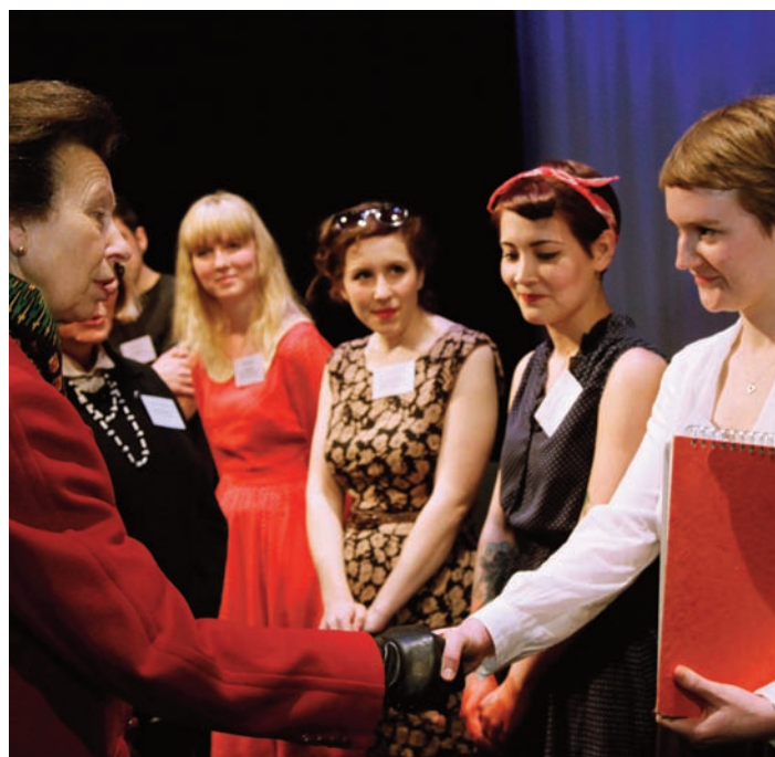
HRH the Princess Royal meeting students at the ArtsTwo opening