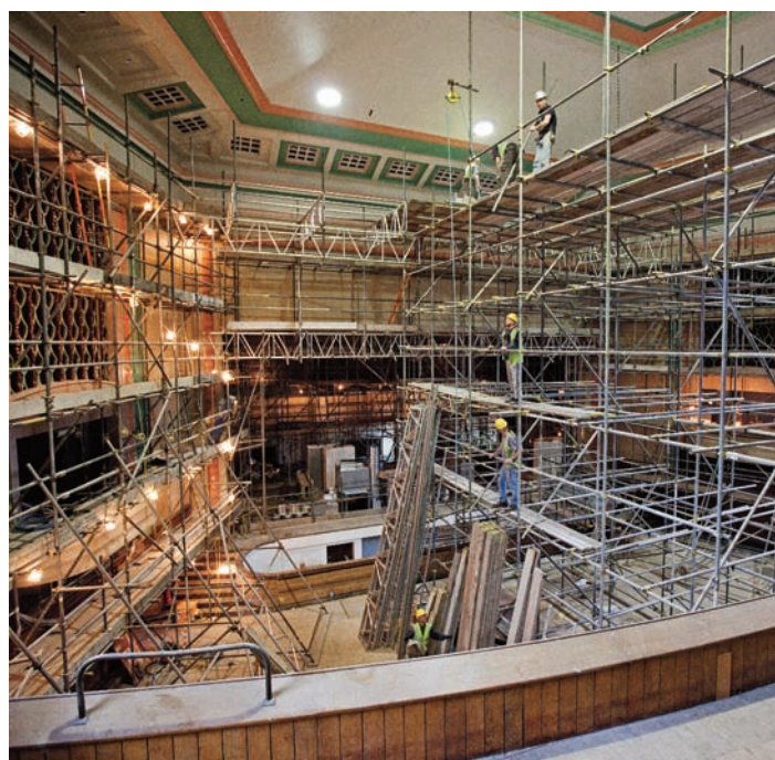
Builders at work on the recent refurbishment of the People's Palace

The works have thrown up a number of interesting discoveries. Fragments of murals by the artist Phyllis Bray – a member of the East London Group of artists popular in the 1920s and 1930s – were found in a space behind the Skeel Lecture Theatre. Depicting music, dance and theatre, a surviving part of the murals has been removed from the wall and remounted on a staircase above the foyer so people can see it once again. The building's original art-deco fire exits signs were also discovered in a forgotten corner of the cellars, and are now back in use, having received the nod of approval from the fire officer.