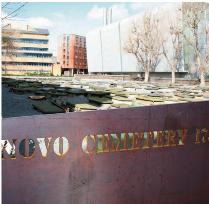
The Novo Cemetery after the re-landscaping work

By the late 1960s, Queen Mary was looking to expand its campus and hemmed in to the east by the cemetery, successfully negotiated with the Sephardic Jewish community to buy the land. In 1974, over 7,000 bodies (including those of Benjamin d'Israeli and Daniel Mendoza) were exhumed and re-interred to a site in Brentwood, Essex, on land owned by the College, a move which continues to be controversial with sections of the Jewish community. The portion of the Novo remaining, then, is perhaps around a fifth of the original size and contains the most recent burials, from the mid-19th Century; this section was left in situ out of respect for any surviving close relatives of the deceased.