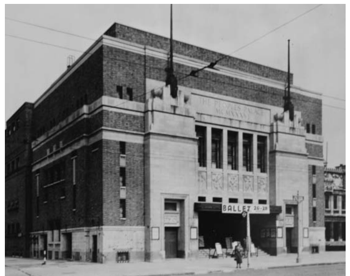
The exterior of the 'new' People's Palace shortly after its opening (c.1937)