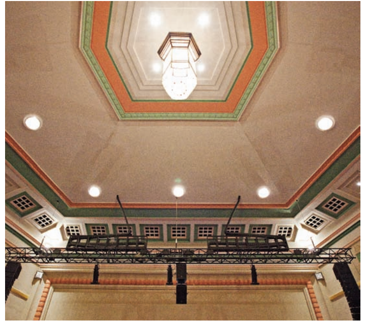
The refurbished interior of the People's Palace including the new lantern